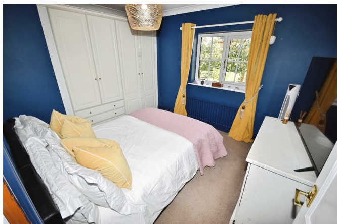
Bedroom 2 9'10" x 10'6"

Window to front elevation with radiator underneath, built-in double wardrobes to one elevation, carpeted flooring, pendant lighting and wall panelling to one wall.