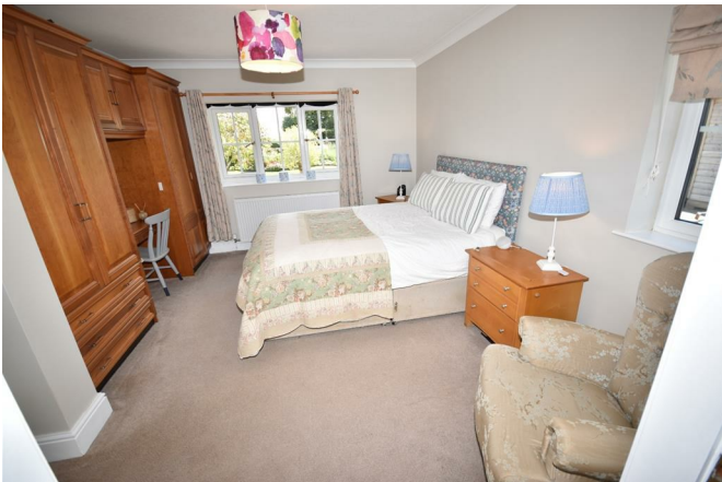
Master Bedroom 14'0" x 11'10"

Window to front elevation with radiator underneath and a smaller window to the side elevation, carpeted flooring, pendant lighting, fitted wardrobes to one elevation with a dressing table in the middle and cupboards above.