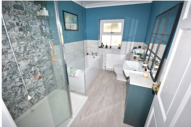
En-suite 10'0" x 6'10"

Window to rear elevation with frosted glass with radiator underneath, vinyl flooring, double shower cubicle with hand-painted tiles within the enclosure having an Aquilisa mixer and rainfall shower unit, panelled bath with mixer tap with half height tiling around it continuing around the remaining two elevations. toilet with hidden cistern, sink with chrome mono bloc tap with vanity unit and shelf.