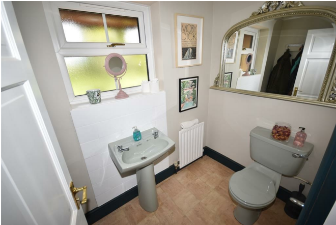
WC 4'6" x 7'6"

Window to front elevation with frosted glass, vinyl flooring, close-coupled toilet, single radiator, pedestal sink with separate hot and cold tap, coat hooks with enough room for storing shoes underneath.